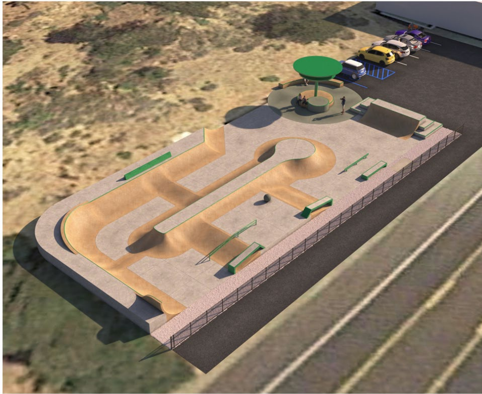
Figure 2 - Proposed conceptual design looking toward the southeast