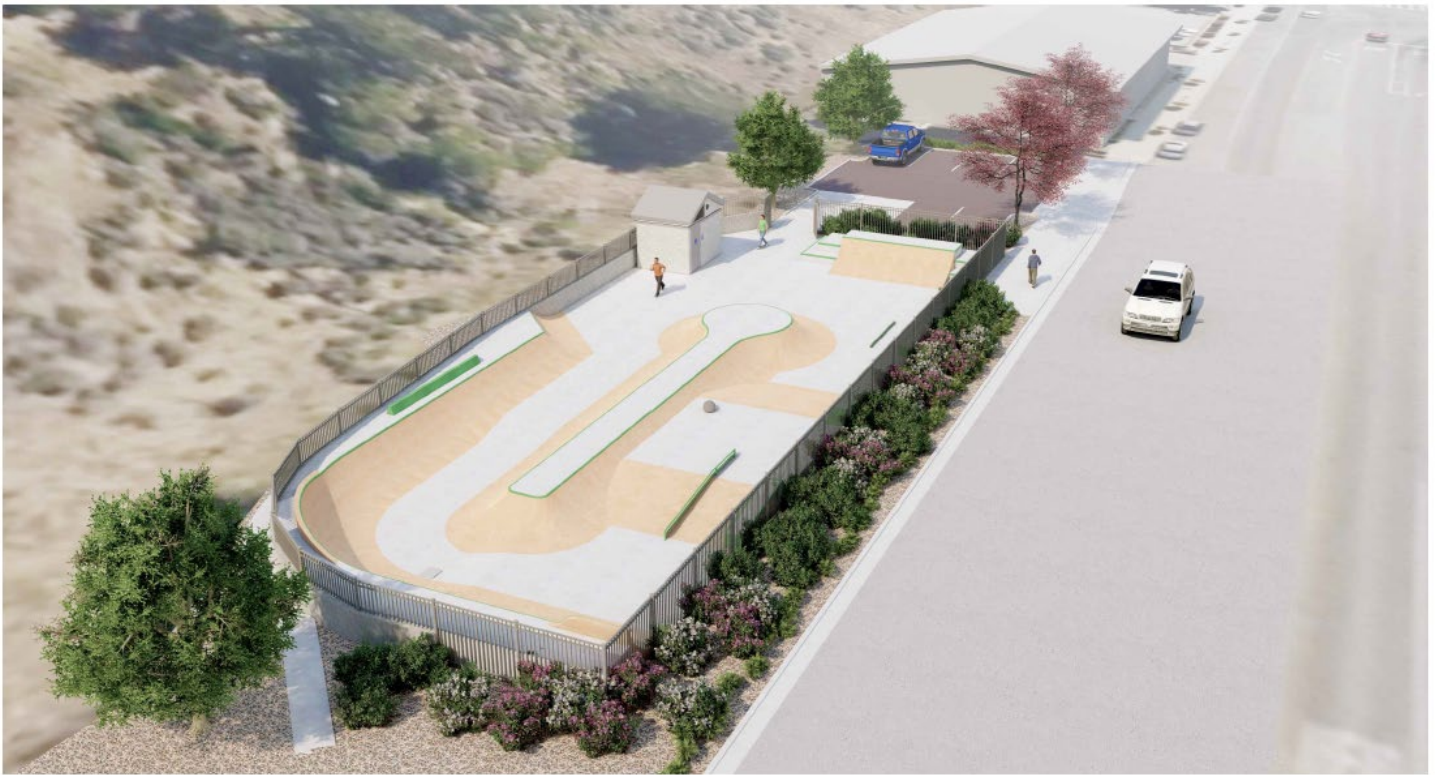
Figure 4 - Proposed conceptual design shown with improvements (improvements are outside the scope of this RFP)

The RFP, as well as any responses to questions/clarifications/requests for additional information, can be viewed, and any questions and requests for further information and/or clarification of the RFP can be submitted on the District's website at https://www.cambriacsd.org/request-for-qualifications-and-proposals .