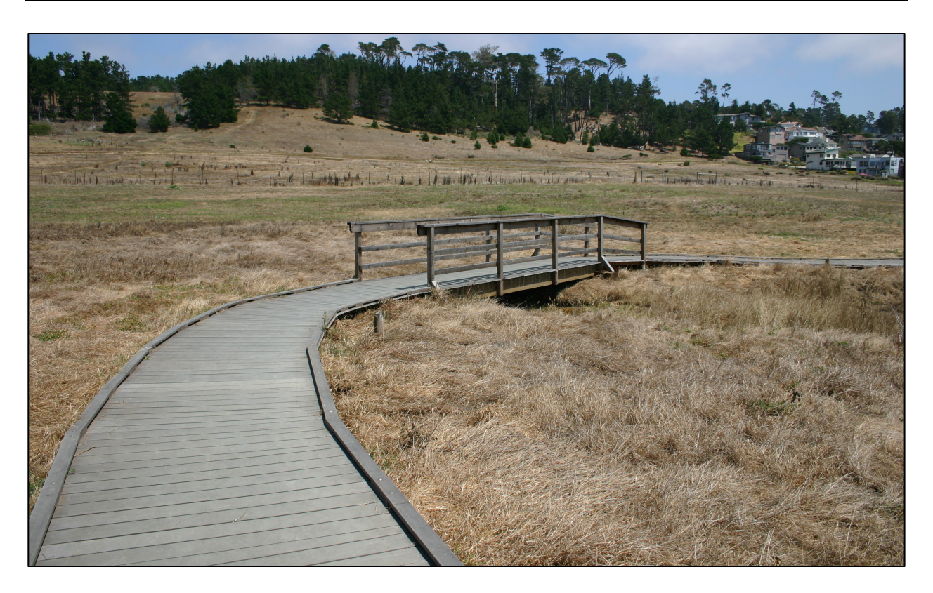
Existing Bluff Trail Improvements FIGURE V-23