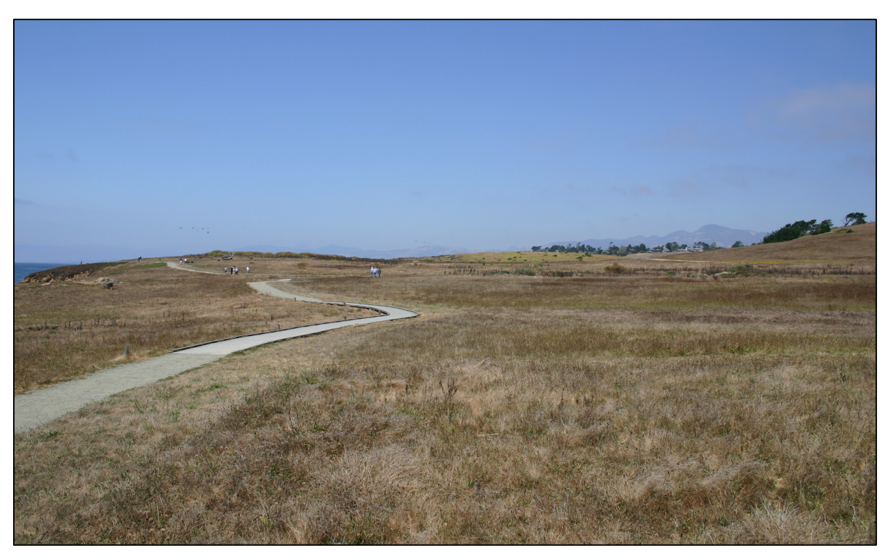
West FRP Bluff Trail Looking North FIGURE V-10