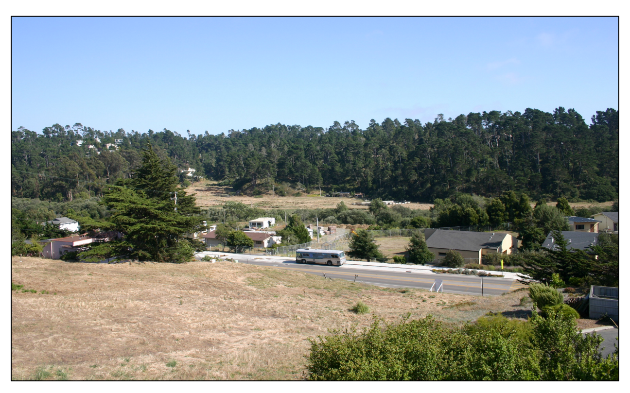
View of the East FRP in the Background from Tamson Drive FIGURE V-21