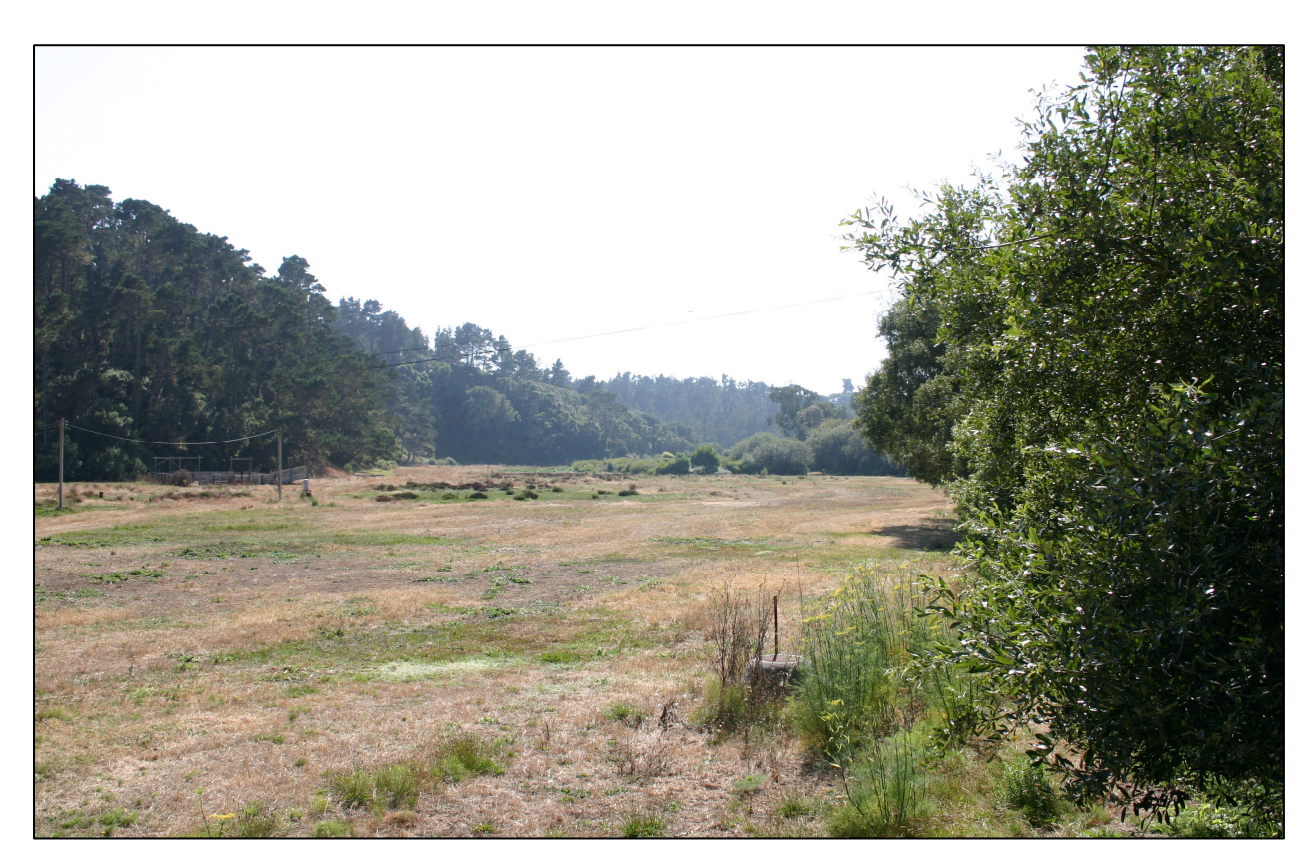
View of the East FRP from the Existing Pedestrian Bridge over Santa Rosa Creek FIGURE V-20