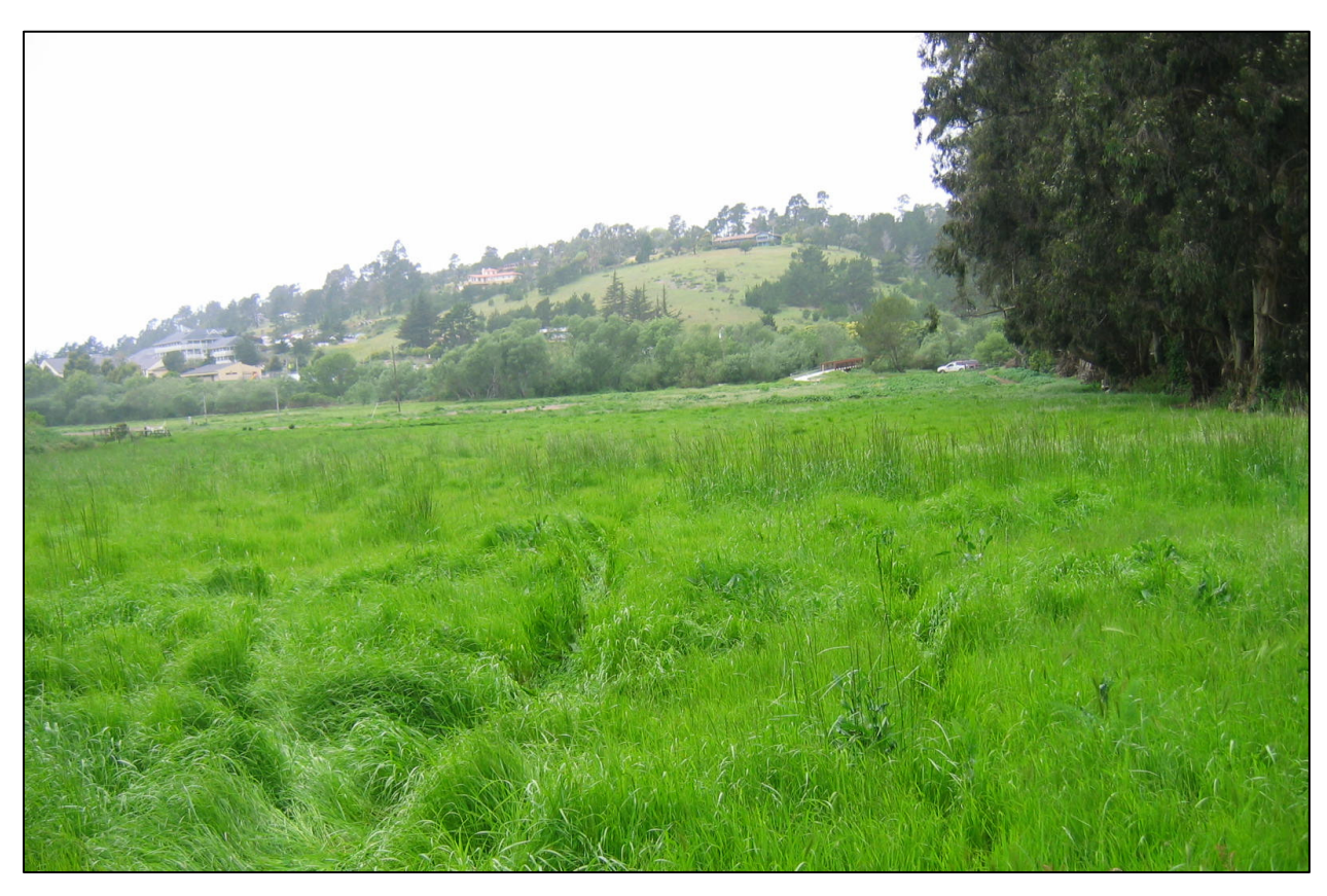
View of East FRP Looking North FIGURE V-22