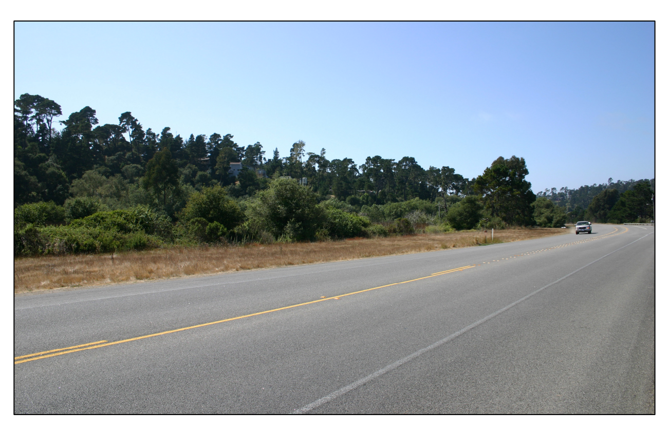
Location of Proposed Central Staging Area West of Highway 1 FIGURE V-24