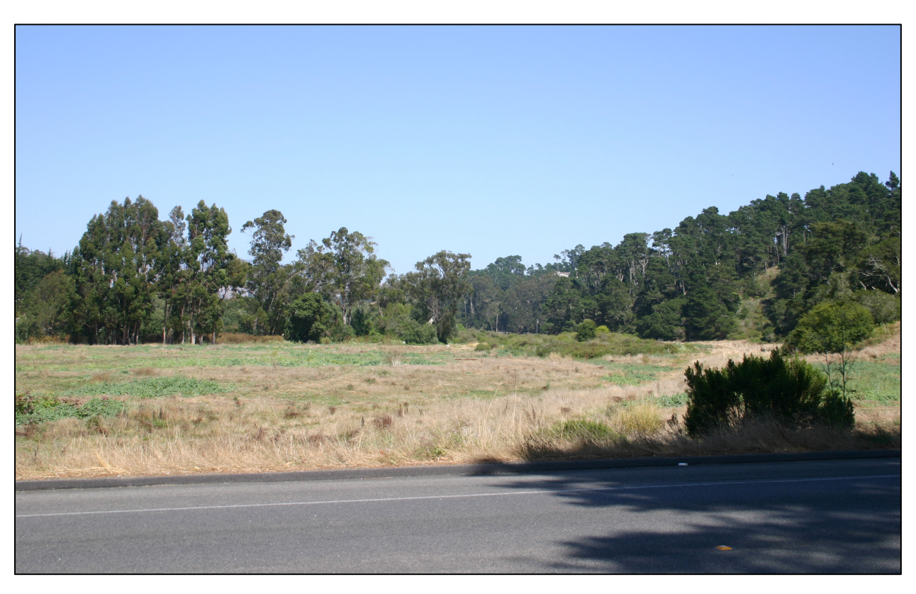
View of the East FRP from Highway 1 FIGURE V-18