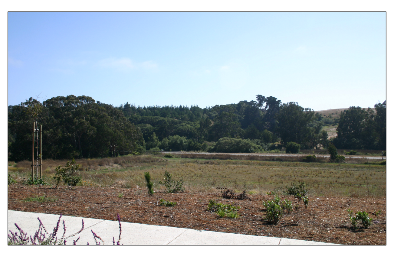
View of the East FRP from Main Street FIGURE V-19