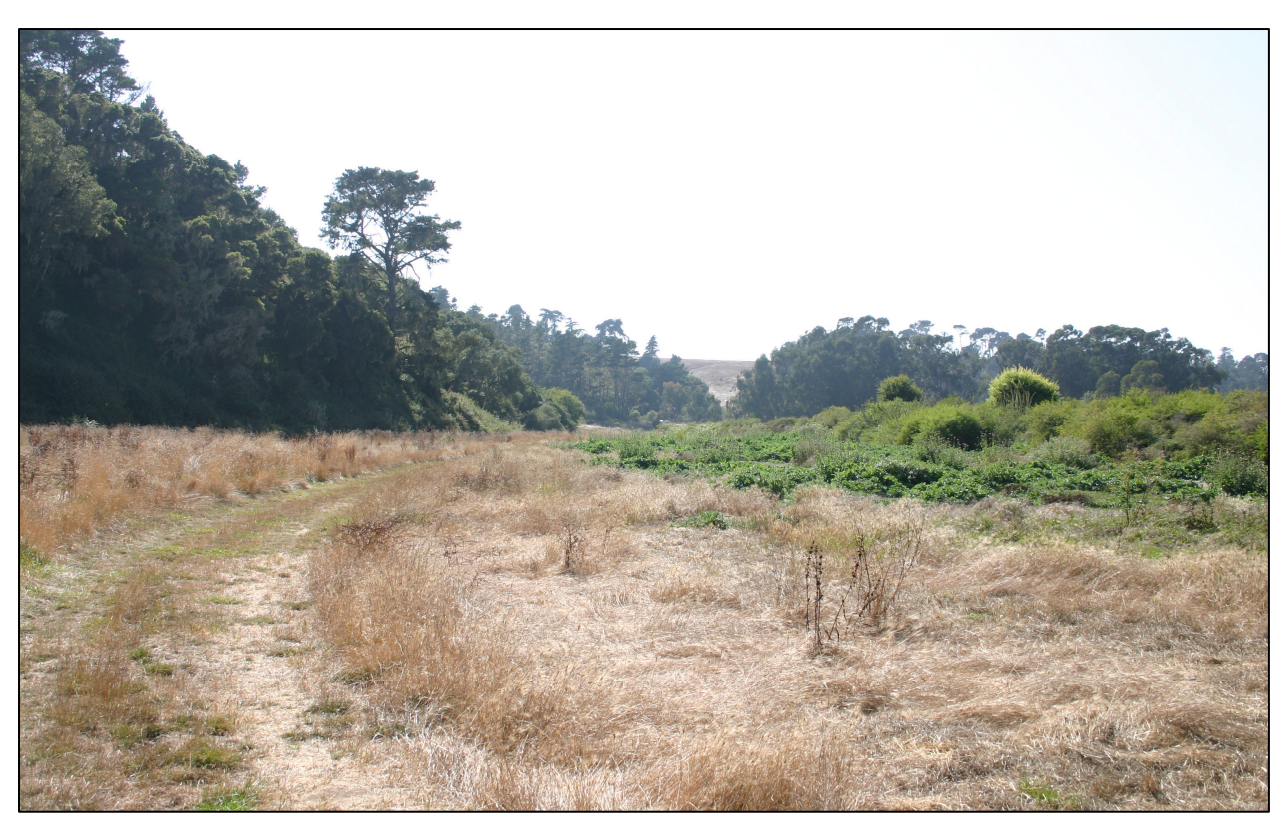
From the East FRP Looking West Toward Highway 1 FIGURE V-17