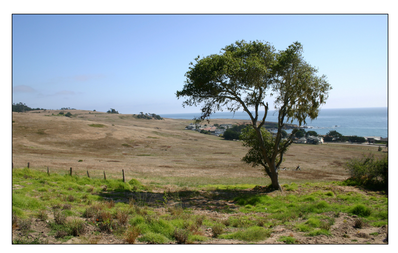
View of the West FRP from the Park Hill Neighborhood FIGURE V-14