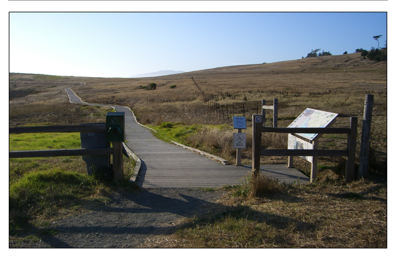
West FRP Bluff Trail at Windsor Boulevard South FIGURE V-11