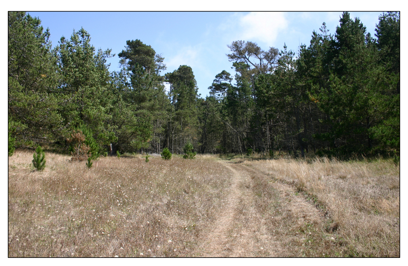
West FRP Forest Loop Trail Area FIGURE V-9