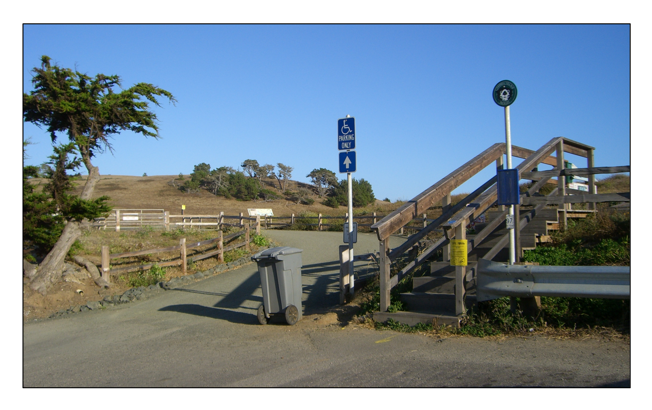
West FRP Bluff Trail at Windsor Boulevard North, West Lodge Hill Neighborhood FIGURE V-12