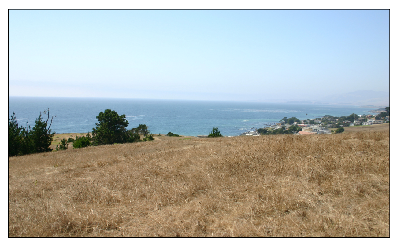
Ocean view from the West FRP FIGURE V-16