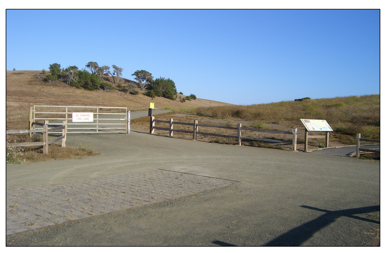
Bluff Trail and Marine Terrace Trail, Looking South FIGURE V-15