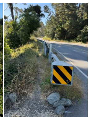
And looking east

Those who do walk along this section have to walk in the roadway, at their peril. Really all that's needed is trimming back the invasive thistles and mustard, as well as a few overhanging tree limbs. I will appreciate any assistance in expediting clearing to improve safety of pedestrians in this section.