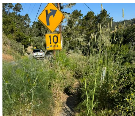
6/18/2024, from the intersection of Burton Drive and Village Lane, looking west

Following up on my comment at the NCAC meeting Wednesday night, rather urgent need to trim back the invasive vegetation overgrowth along the north side of Burton Drive between the intersection of Burton Drive and Eton Road and the Santa Rosa Creek bridge, between points A&B on the Google Maps screenshot below. This is about a 0.4 mile section that would have fairly substantial foot traffic if it weren't so hazardous.