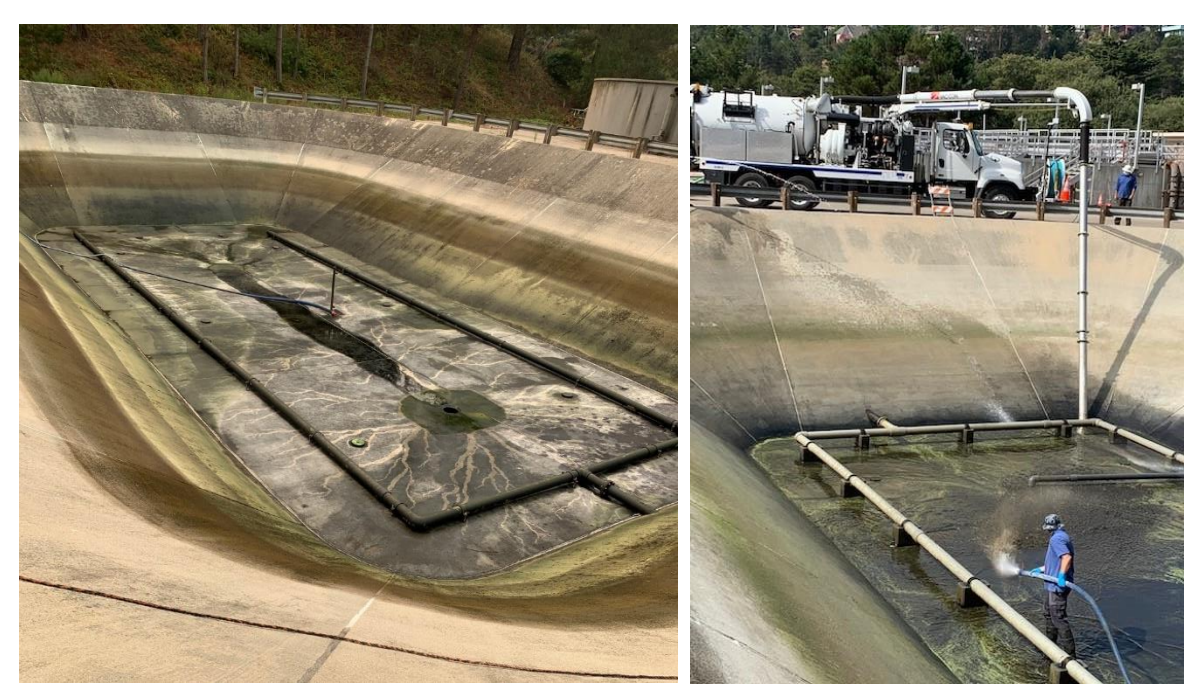
Figure 2 Cleaning out the effluent holding ponds

We have gone out to bid on the remainder of the buildings at the plant that need to be painted; we hope to have this work completed before the rainy season.