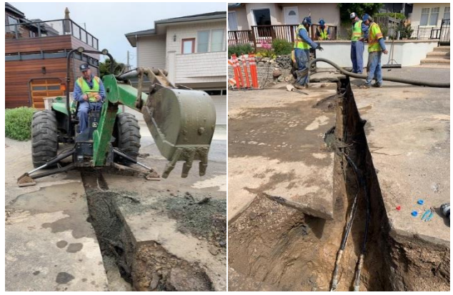
Figure 3 Water Dept staff onsite for a leak repair

There were no interruptions in service to customers except for the immediate homes that